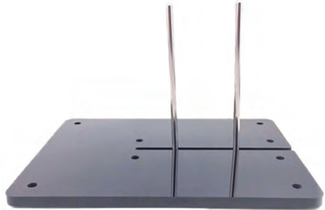
INSTRUMENT STRINGER HOLDING BOARD 7.75" X 10.5"

SHB-B1 Holds stringers while instruments are being placed on them. ( Stringer not included. )