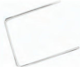
OPEN END STRINGER 5.5 in. width