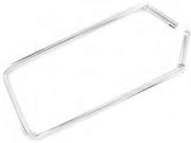
CENTER LATCH STRINGER 3.0 in. width