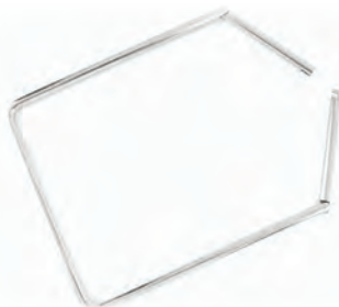
CENTER LATCH STRINGER 5.75 in. width