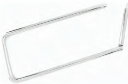
PIN LOCK STRINGER 2.75 in. width