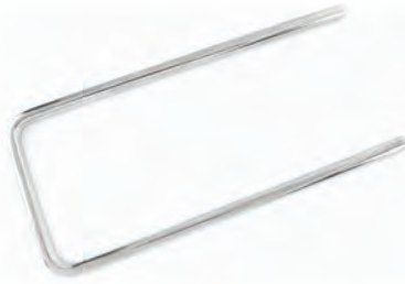
OPEN END STRINGER 2.75 in. width

The use of instrument stringers is integral to the preparation of instruments for sterilization. Stringers hold ring-handled instruments open during the cleaning process, to ensure the maximum surface area of the instruments are exposed to the cleaning solution. A closed instrument may conceal bioburden which, if left intact, would require additional cleaning methods. The open position of the instruments on the stringers also ensures better exposure to heated air drying, for quicker dry times.