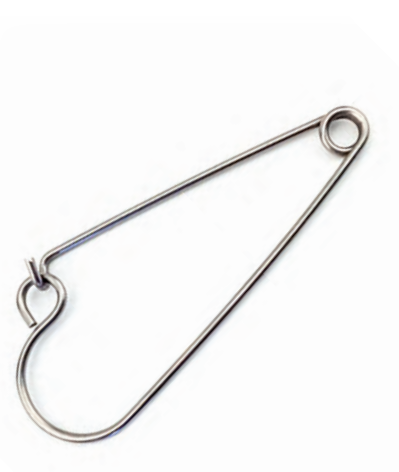
BUNT FORCEPS HOLDER

SHB-B1 Holds stringers while instruments are being placed on them. ( Stringer not included. )