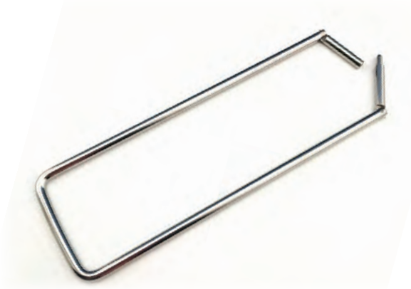
PIN AND SOCKET STRINGER 3.0 in. width