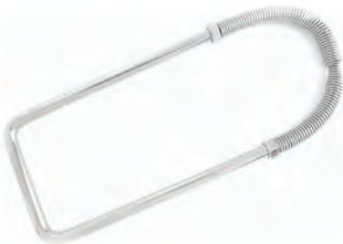
SPRING STRINGER 2.75 in. width