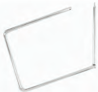
PIN LOCK STRINGER 5.5 in. width