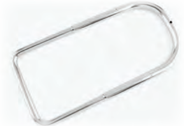
WEINSTEIN STRINGER 3.0 in. width